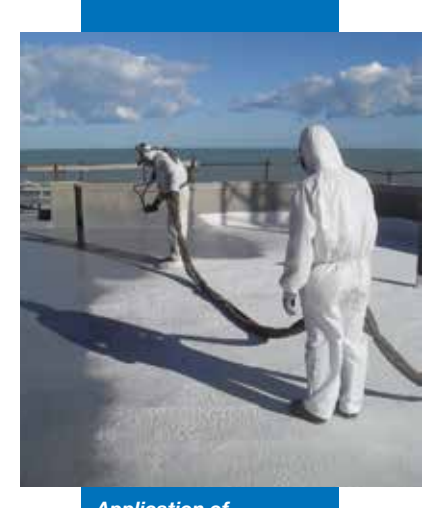
Application of Purtop 400 M over Triblock P