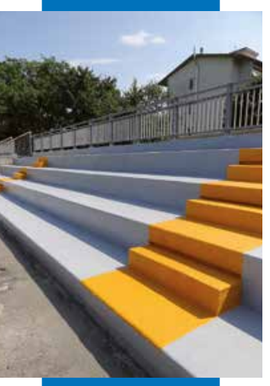
Spectator terraces waterproofed with Purtop 400 M coated with Mapefloor Finish 55