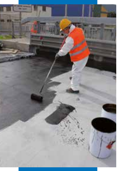
Application of Purtop Primer Black

systems") and the requirements of the EN 1504-2 coating (C) according to principles PI, MC, PR, RC and IR ("Surface protection systems for concrete").