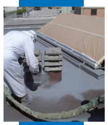
Application of Purtop 400 M over a bituminous membrane

Purtop 400 M component B is irritant for the skin, the eyes and the respiratory tract. It may cause sensitization when inhaled and frequent contact with the skin may cause an allergic reaction in those sensitive to isocyanates. It is harmful when inhaled and may cause irreversible damages if it is used for lengthy periods. During use wear protective clothing, gloves, safety goggles and a mask to protect the respiratory tract, and use only in well ventilated areas. If the