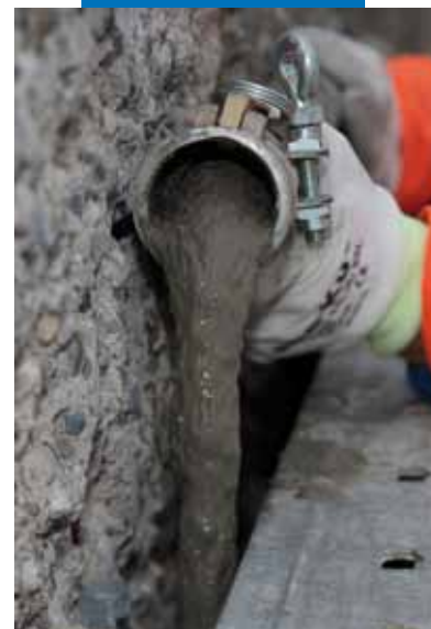
Application of Mapegrout Hi-Flow GF