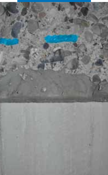
Mapegrout Hi-Flow GF after stripping the formwork

As an alternative, after tamping the surface of the mortar, apply Mapecure E anti-evaporation agent in water emulsion with a low pressure pump, Mapecure S film-forming curing agent for mortar and concrete or Elastocolor Primer , high-penetration solvent fixing agent for absorbent surfaces and curing agent for repair mortar.