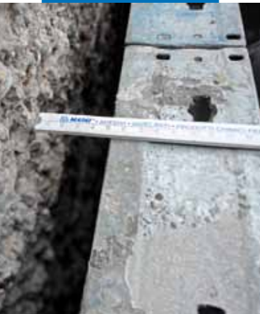
Positioning the sealed formwork once it has been carefully prepared