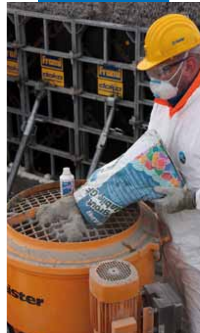
Preparing Mapegrout Hi-Flow GF with an addition of Mapecure SRA