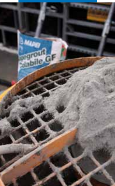
Mapegrout Hi-Flow GF before mixing