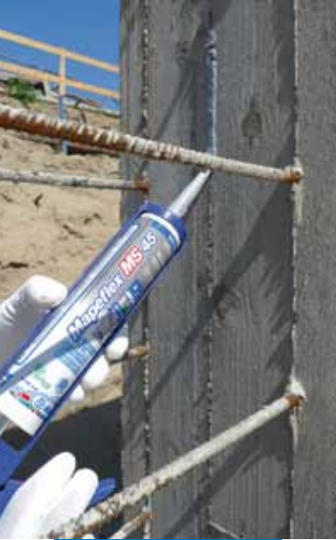
Extruding Mapeflex MS45 prior to applying Idrostop Soft in second pours