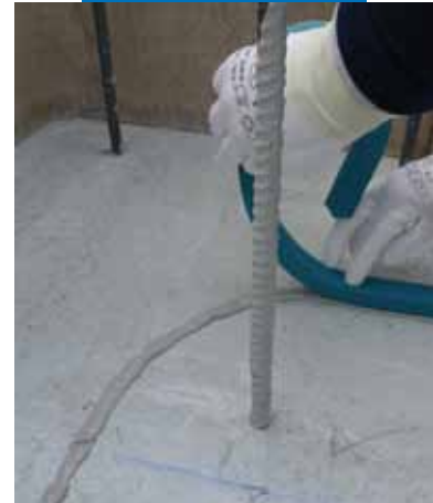
Applying Idrostop Soft on horizontal surfaces

All relevant references for the product are available upon request and from www.mapei.com