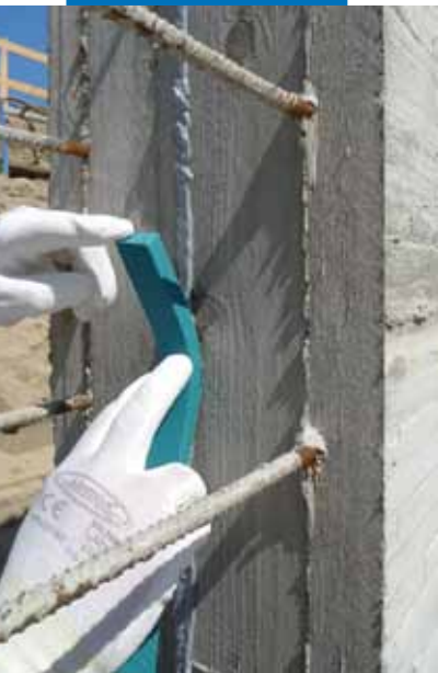
Applying Idrostop Soft on vertical surfaces